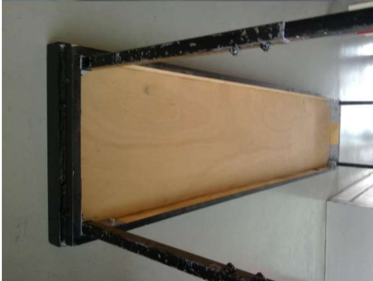
Table measures: Long: 2.50m deep: 60cm high: 90 cm edge: 5 cm. Black cloth on sides and front, Back open