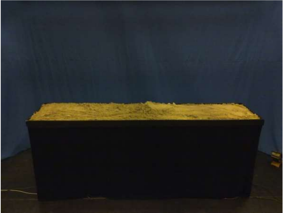
100 Kilo's of clean beach sand or playground sand