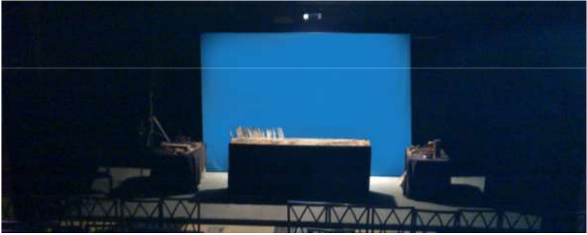
Version in Brasil with tables on the side and lights in grid