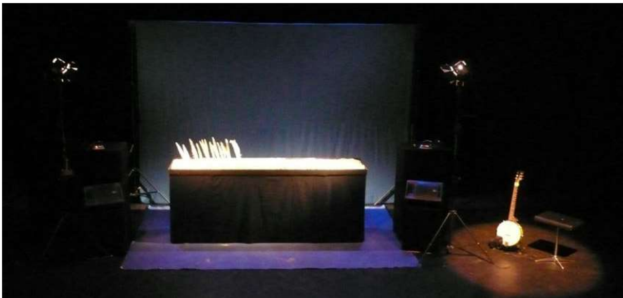
Original version with two small cupboards on the side and lights on stands

Objects for the performance, blue backdrop, CD or ipod with audio for the show. if necessary Guitar