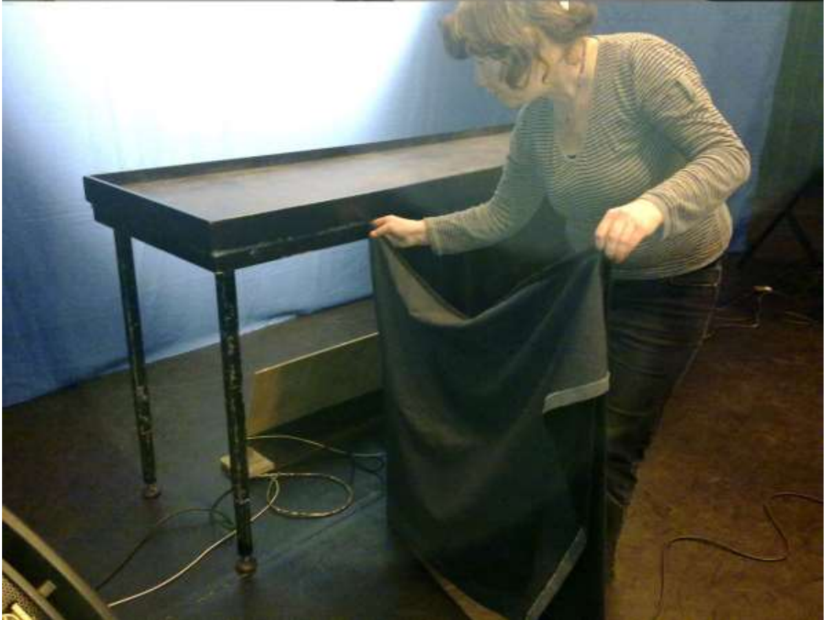
Black cloth at front and sides ( not on back)