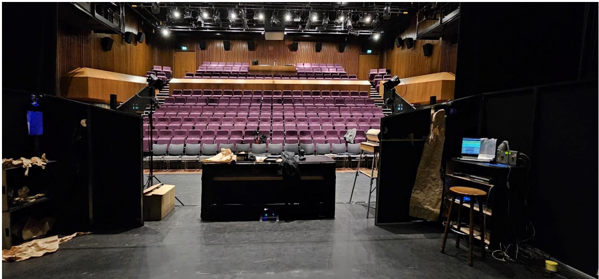
Example of set up in theatre with our own material (NB this is not the flying version, just to give you an idea of the set)

If you have any questions or comments, please contact Gérard +31623022764 – office@tamtamtheater.nl